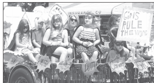
Theme is "Red, White and Blue"