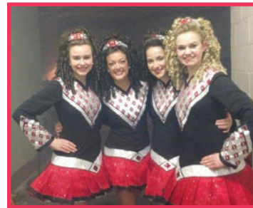
Rince na Chroi